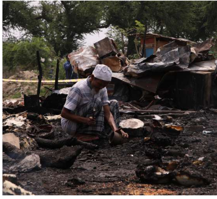
ROHINGYA REFUGEE CAMP Kanchan Kunj, New Delhi